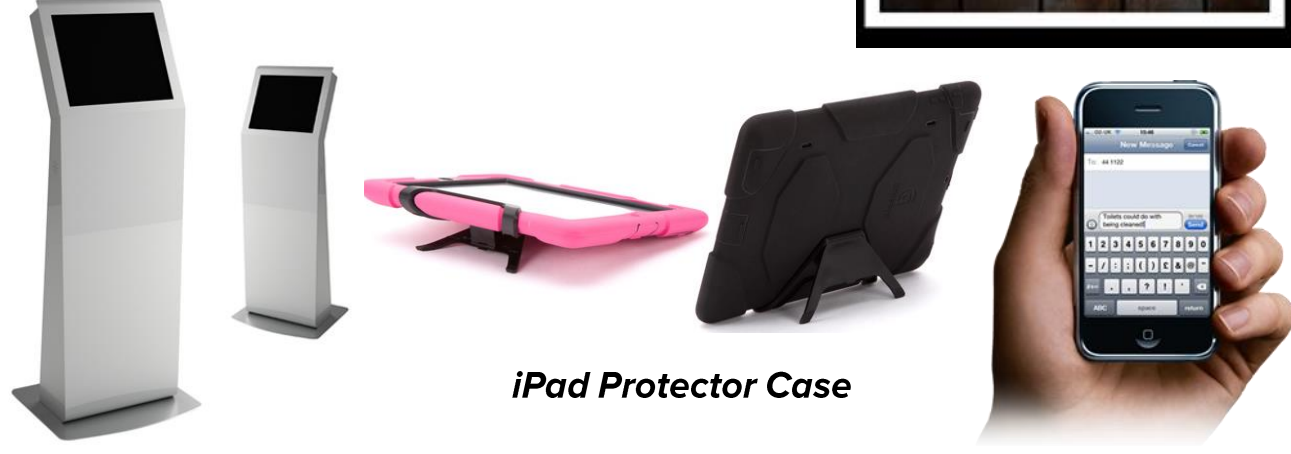
Indoor Sleek Kiosks with Keyboard and Touch screen combination